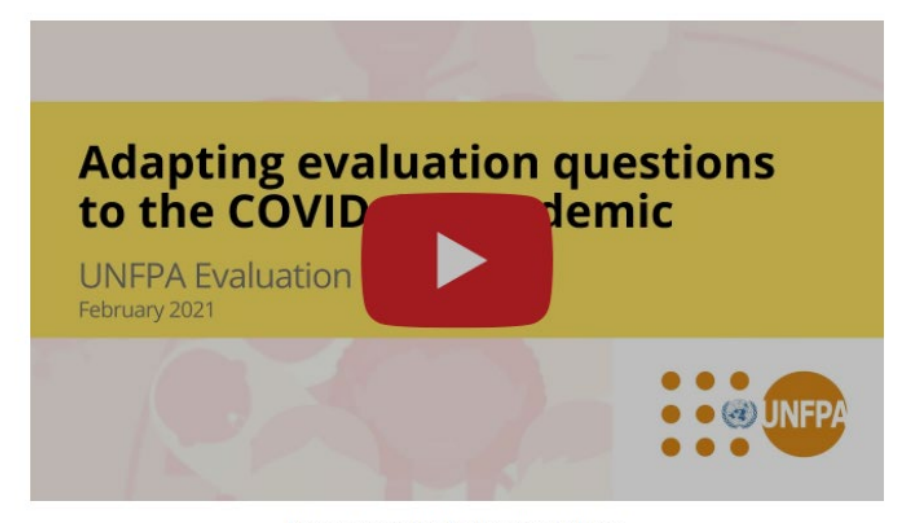
Learn more about this new guidance

Given the protracted crisis and increasingly dynamic contexts, UNFPA programmes, priorities and modes of engagement have been revisited, redesigned, and repurposed to better respond to emerging needs and to ensure an equitable and sustainable recovery across development, humanitarian, and fragile contexts. In response to these changing realities, evaluators must rephrase evaluation questions and subsequent analysis to ensure integration of COVID-19 related issues, in order to ensure UNFPA evaluations continue to provide the highest relevance and quality of evidence on UNFPA performance and its response and adaptation to the crisis.