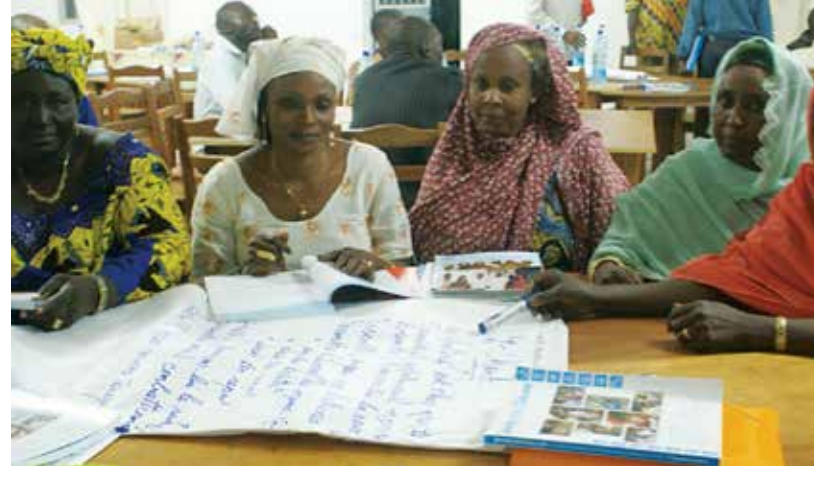
Community Health Workers' pools in Cameroon

In Burkina Faso and Cote d'Ivoire, an innovative 'Ecole des maris' ( School of Husbands ) project engages husbands who can have a positive influence on the behaviour of their peers to promote shared decision-making in the household, as well as supporting the education of girls, and the prevention of gender based violence.