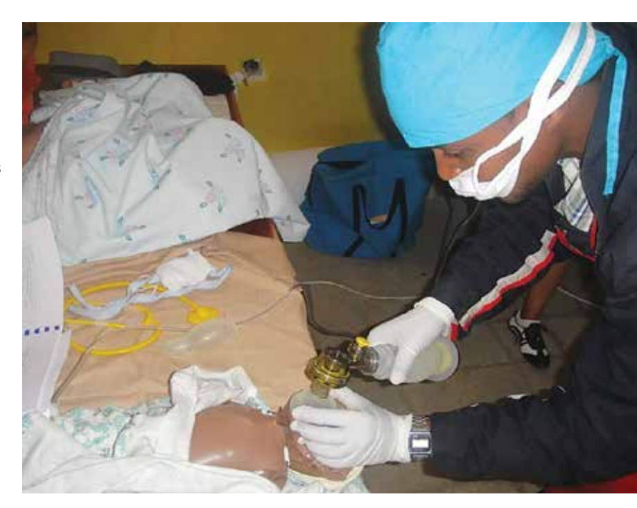
Basic Emergency Obstetric and Neonatal Care Training in Ethiopia

Another key aspect of H4+ support for health systems is human resources for health by addressing the urgent need for skilled health (Area of Work 4) in high burden countries. H4+