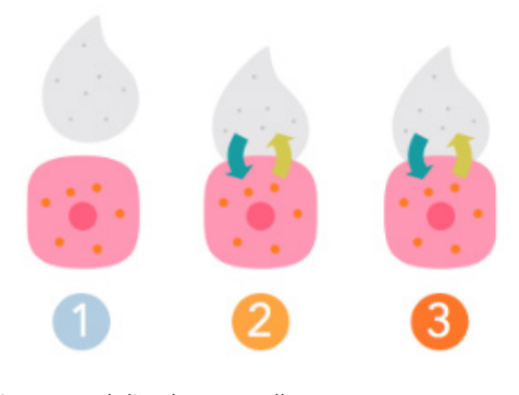
Iso-osmolality: happy cells

When a lubricant has an osmolality similar to that of the body's cells, little water flows into or out of the epithelial cells and everything remains in balance. This is called iso-osmolality and is ideal for a water-based lubricant.