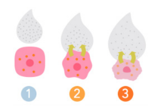
Hyper-osmolality: dried out, shrunken cells

When a lubricant has high osmolality , it not only draws water out of epithelial cells, but also draws water into the lumen of the vagina or rectum. This is called hyper-osmolality . If osmolality is very high, it can cause cells to shrink, die and slough off, leaving the vagina or rectum irritated and more susceptible to infection. The shrunken cells also send out a danger signal to the immune system and initiate inflammation. Many lubricants on the market are hyperosmolar. They may feel fine, but have toxic effects that do not cause most users any pain (silent toxicity).