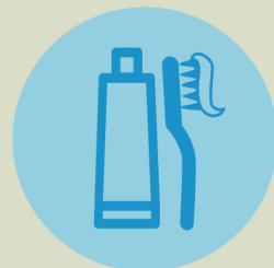
Toothbrush & Toothpaste