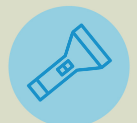
Flashlight with batteries