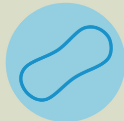
Reusable sanitary napkin