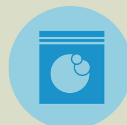
Cloth washing soap