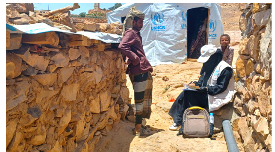
Distribution of rapid response kits in Al Jawf and Marib