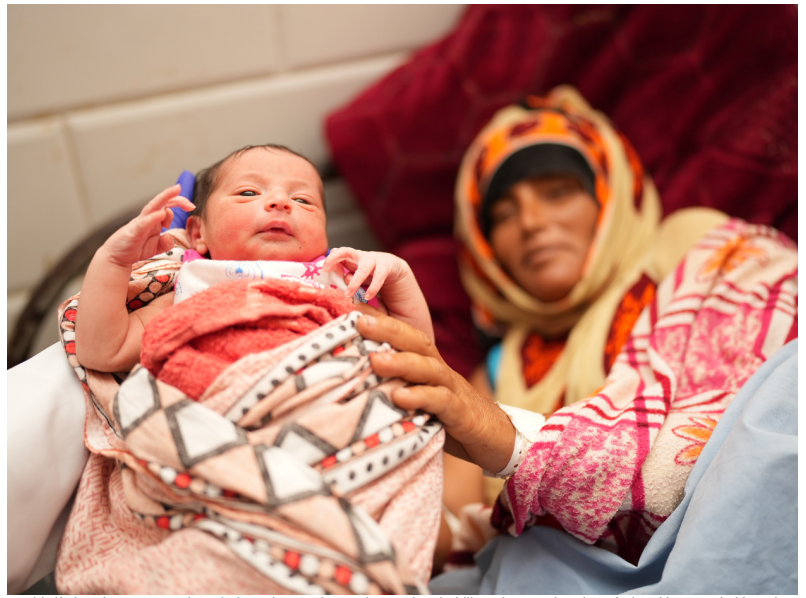
A midwife hands over a newborn baby to her mother at the newly rehabilitated maternity wing of Al Mokha Hospital in Taizz, Yemen