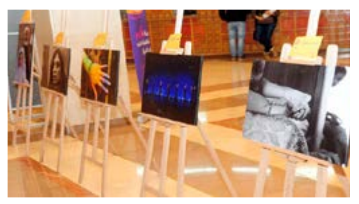
Photo exhibition organized by UNFPA as part of the national campaign to combat genderbased violence in Syria.