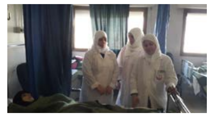
Health workers say they are redoubling their efforts to ensure consistent and quality care for pregnant women, new mothers, and others seeking assistance at the UNFPA-supported hospital.