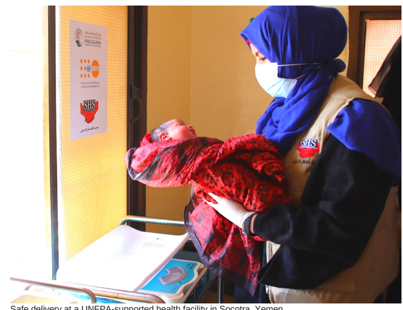
Safe delivery at a UNFPA-supported health facility in Socotra, Yemen