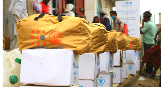
Distribution of rapid response kits in Al Jawf and Marib Governorates.