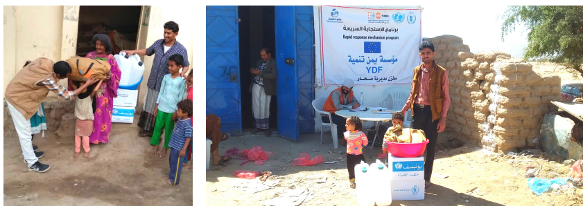
Distribution of RRM kits among displaced families in Sa'ada and Sana'a Governorates