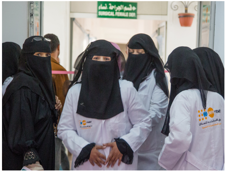
Midwives at a UNFPA-supported health facility in Sana'a