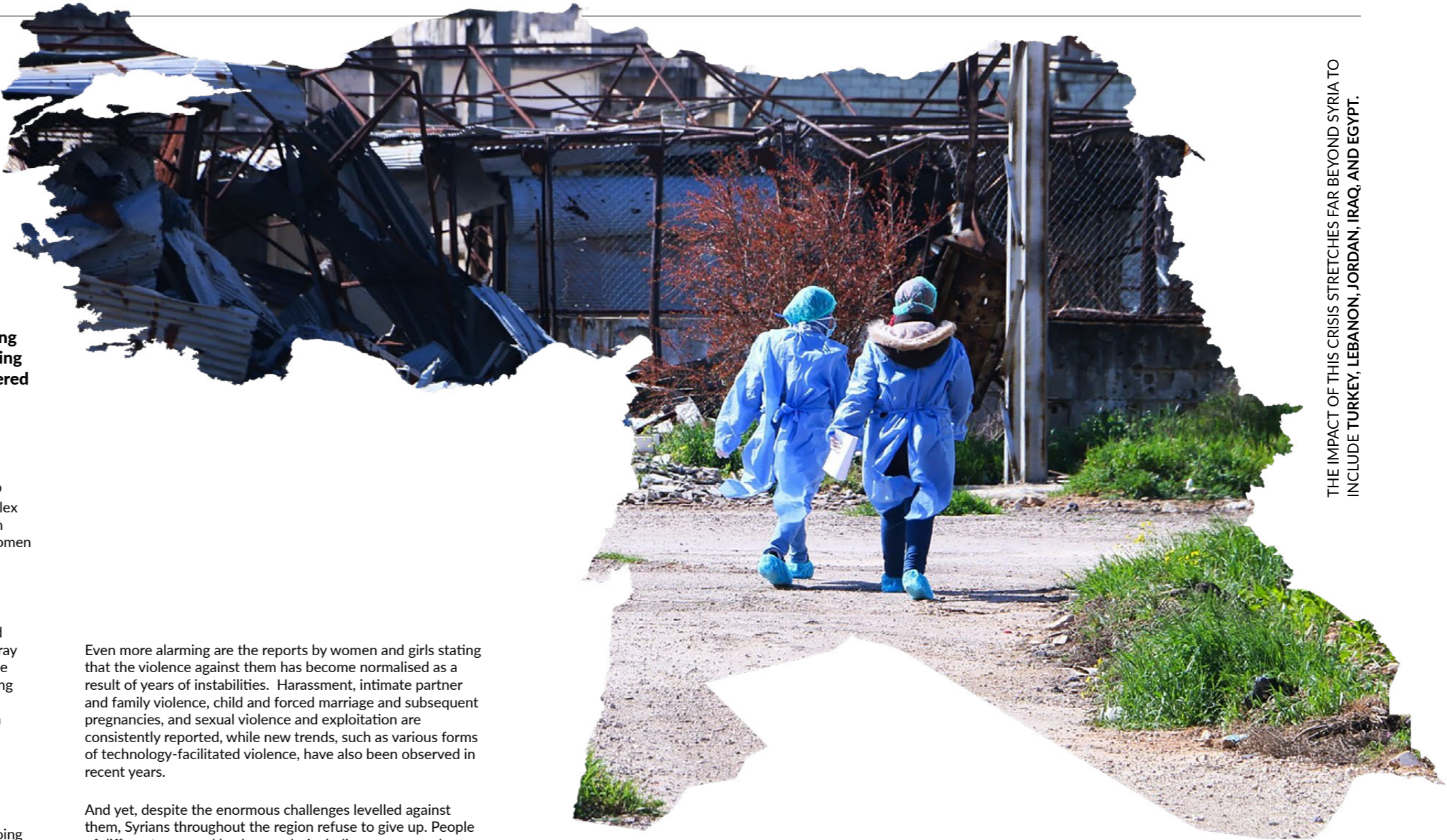
THE IMPACT OF THIS CRISIS STRETCHES FAR BEYOND SYRIA TO INCLUDE TURKEY, LEBANON, JORDAN, IRAQ, AND EGYPT.

Moreover, these risks are further compounded by the deteriorating economy and widespread poverty, lack and loss of livelihoods, destruction and loss of housing and property, protracted and multiple cycles of displacement, substandard living conditions (even for people in areas of relative stability), and shortage of natural resources. This is further increasing reliance on negative coping mechanisms such as early and forced marriage and sexual exploitation and abuse.